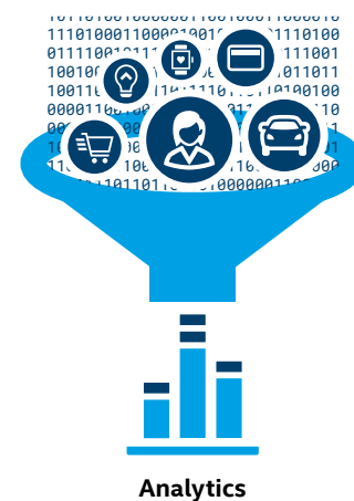
Figure 2. Due to bandwidth and capacity limitations, legacy analytics solutions often either ignore large swaths of valuable source data or deliver results too slowly to be practical.