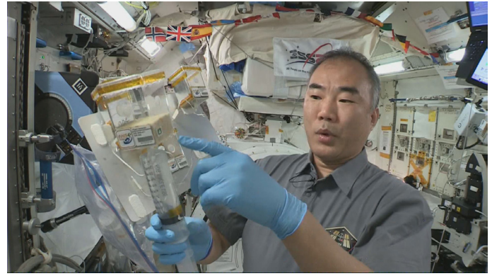
Astronaut Soichi Noguchi starts cultivation of Asian Herb in Space Plant experiment project.

While TOKI is readied for production, benchmarking indicates the system's performance meets JAXA users' needs based on five in-house workloads and traditional benchmarks: HINOCA (combustion simulation), FaSTAR (a high-efficiency CFD tool), UPACS (fluid analysis software), P-FLOW (moving particle simulation), and LS-FLOW (CFD code).