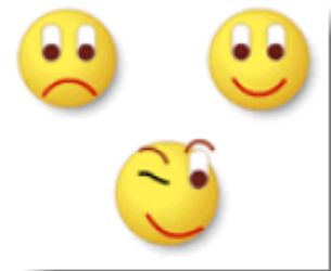
Figure 2: Emoticons can save you time when you want to express approval or disapproval about a topic.